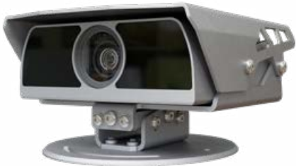
On-Board ANPR+MMR, powered by: CARMEN®

Technical specifications are subject to change without prior notice. This document does not constitute an offer. Custom configurations are available when the above mentioned product does not fulfil project requirements. Please contact our sales team to discuss your project needs and explore tailored solutions. We are happy to help.